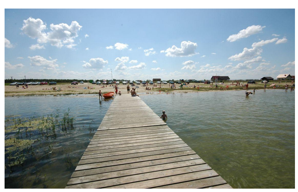
Fig. 7. Jetty on the Przykona water reservoir in the Adamów mine

The above mentioned reservoirs are precious to local inhabitants as they provide a place to rest, create new jobs and increase the attractiveness of the neighbouring building lots.