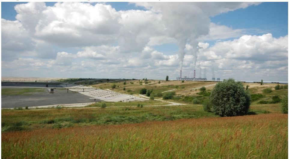
Fig. 8. Ash waste dump site for the Belchatów Power station on the internal dumping site of the Belchatów Field

So far the Polish lignite mining industry has not followed the cultural approach, and the economic approach has been present in a limited way - one could mention here, for example, the windmill farm on the external dumping site of the Bełchatów mine or the construction of industrial and municipal waste dumping sites in the workings and dumping sites of particular lignite mines. Internal dumping sites (e.g. in the Bełchatów, Konin and Turów mines) are sometimes used to store ashes from power stations and as a result they are rendered harmless there. It seems that in the field of promotion and application of reclamation approaches other than traditional ones there is a lot to do in comparison to, for example, our western neighbours.