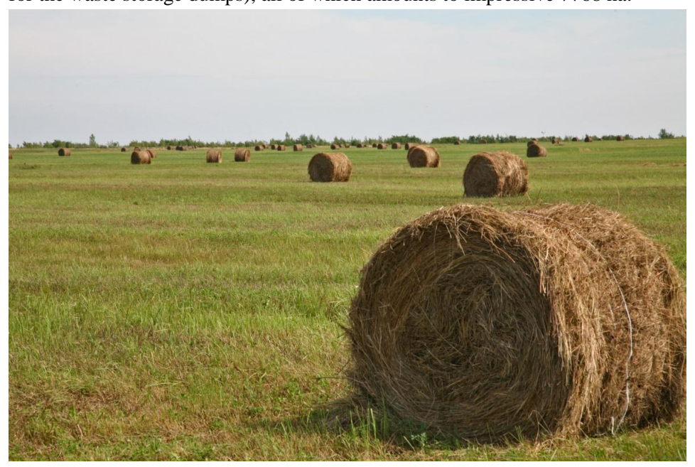
Fig. 2. Lucerne crops on the dumping ground of the Konin mine Lubstów open-pit

purposes 2185 ha, for forestry 928 ha, and as regards water and special approaches - 514 ha (including 165 ha of the Przykona water reservoir). In the case of the Konin mine the figures are significantly higher which is due to a much wider scale of operations. Till the end of 2010 the agricultural approach accounted for 3909 ha, forestry approach - 2402 ha, hydrological approach - 596 ha, recreational approach - 160 ha, and other approaches - 701 ha (it is mainly for the waste storage dumps), all of which amounts to impressive 7768 ha.