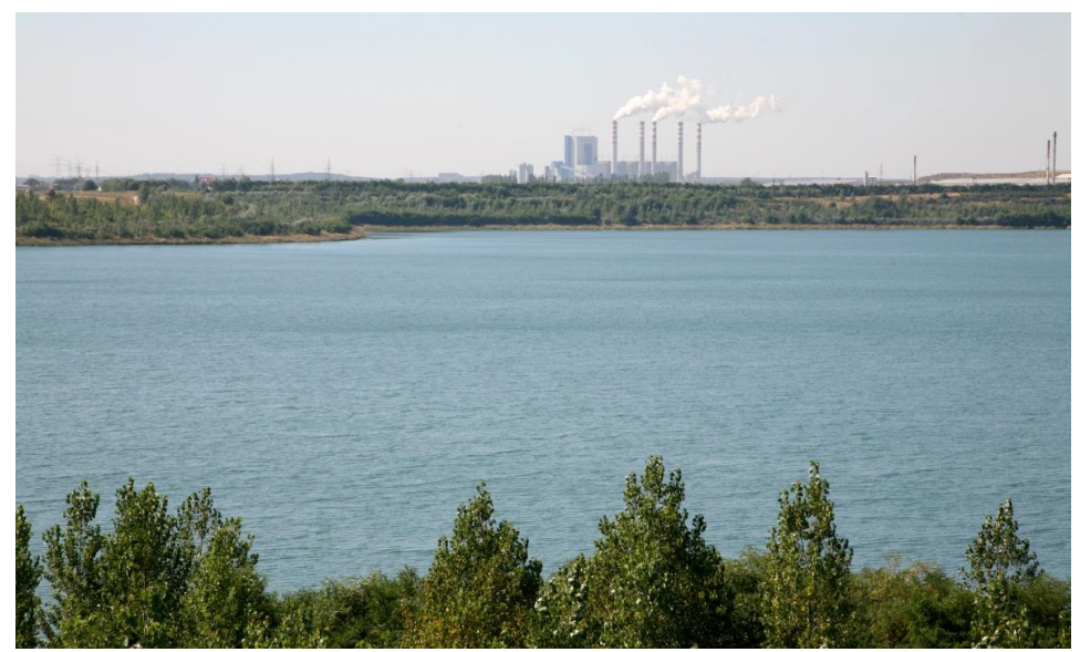
Fig. 6. The biggest water reservoir in the lignite mining sector on the site of the Patnów open-cast in the Konin mine

Due to the single open-cast character of the exploitation the hydrological approach to reclamation in the Turów and Bełchatów mines consisted mainly in the creation of small water ponds in the external dumping sites. However, the situation is different in the case of the Adamów and Konin mines that have several open-casts. The former one constructed three medium-size reservoirs: Bogdałów, Przykona and Janiszew that serve the inhabitants as recreational sites in hot summers. The Konin lignite mine has the greatest experience in hydrological reclamation. So far 6 water reservoirs of the total area of 600 ha have been built. They are located in the former workings of the Niesłusz, Gosławice, Patnów, Jóźwin IIA and Kazimierz Południe open-casts. The reservoir in the Patnów open-cast is at present the biggest lake in the lignite mining with a surface of around 350 ha and a volume of almost 90 mln m<sup>3</sup>. In the reservoir in the Lubstów open-cast, where the exploitation finished in 2010, reclamation is being carried out aiming at the construction of the biggest postmining reservoir in Poland - bigger than the Machów reservoir - with the surface of over 480 ha and volume of almost 150 mln m<sup>3</sup>.