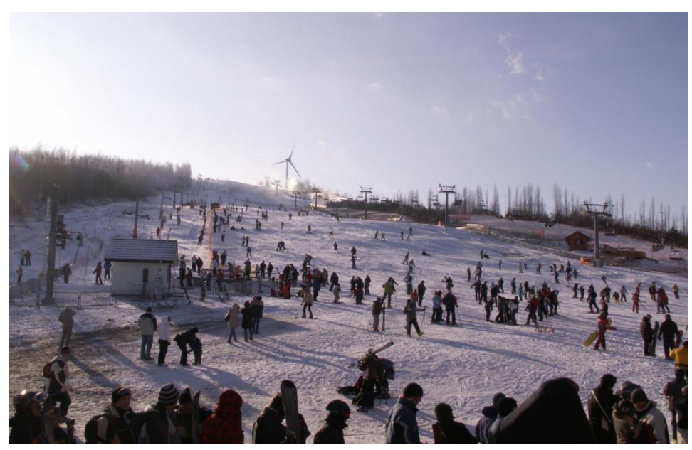
Fig. 4. A view on the ski run and sleigh track in Góra Kamieńsk in the Bełchatów mine